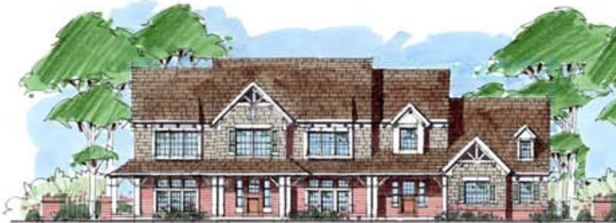
ELEVATION 'A' W/ PARTIAL BRICK