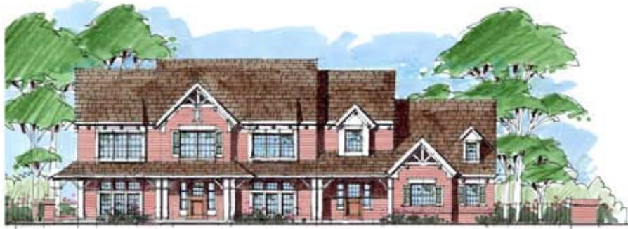
ELEVATION 'A' W/ FULL BRICK