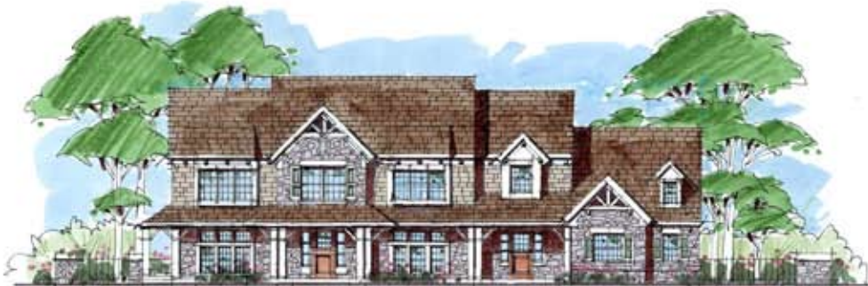
ELEVATION 'A' W/ PARTIAL STONE